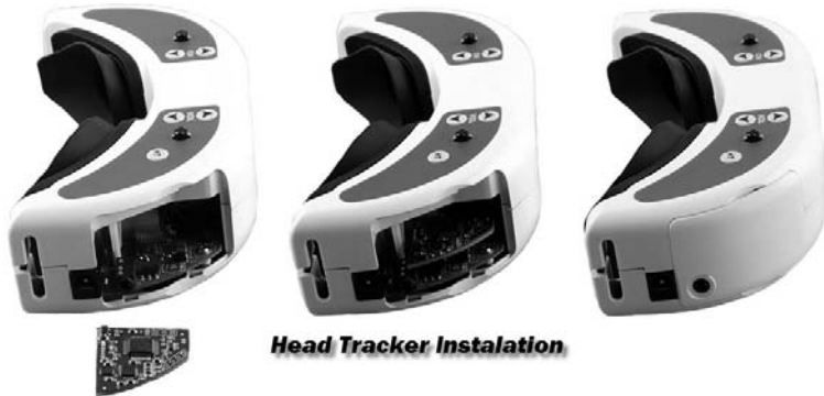
Head Tracker Instalation

Refer to head tracker module manual for up to date and detailed menu setup instructions. For individual radio setup instructions please visit our head tracking support forum at www.FPVlab.com Forum: Sponsors Gate/Fat Shark/Head tracker radio support.