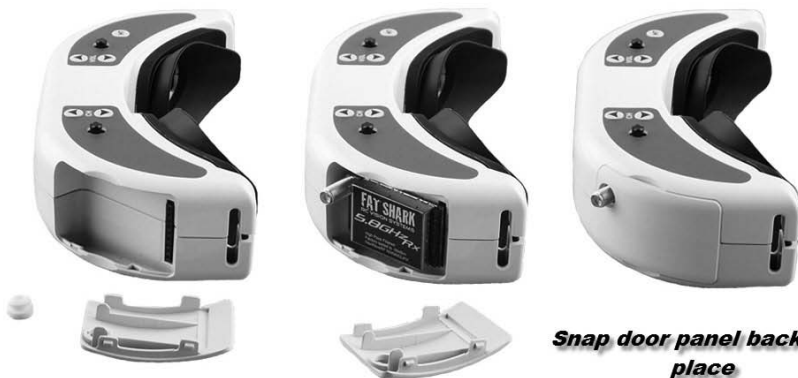
Remove door panel Remove hole plug